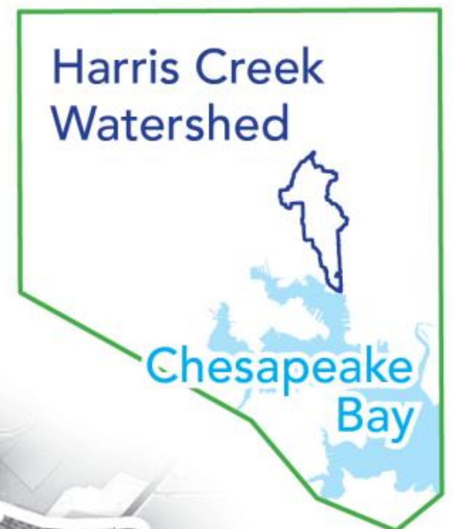
BALTIMORE CITY MAP

This map highlights a few notable spots in your watershed as told by your neighbors. Connecting them all is bikeable route you can use to explore these spots. Visit them in person, Learn more about your watershed, or see the website linked below for more notable places. —Happy Exploring!